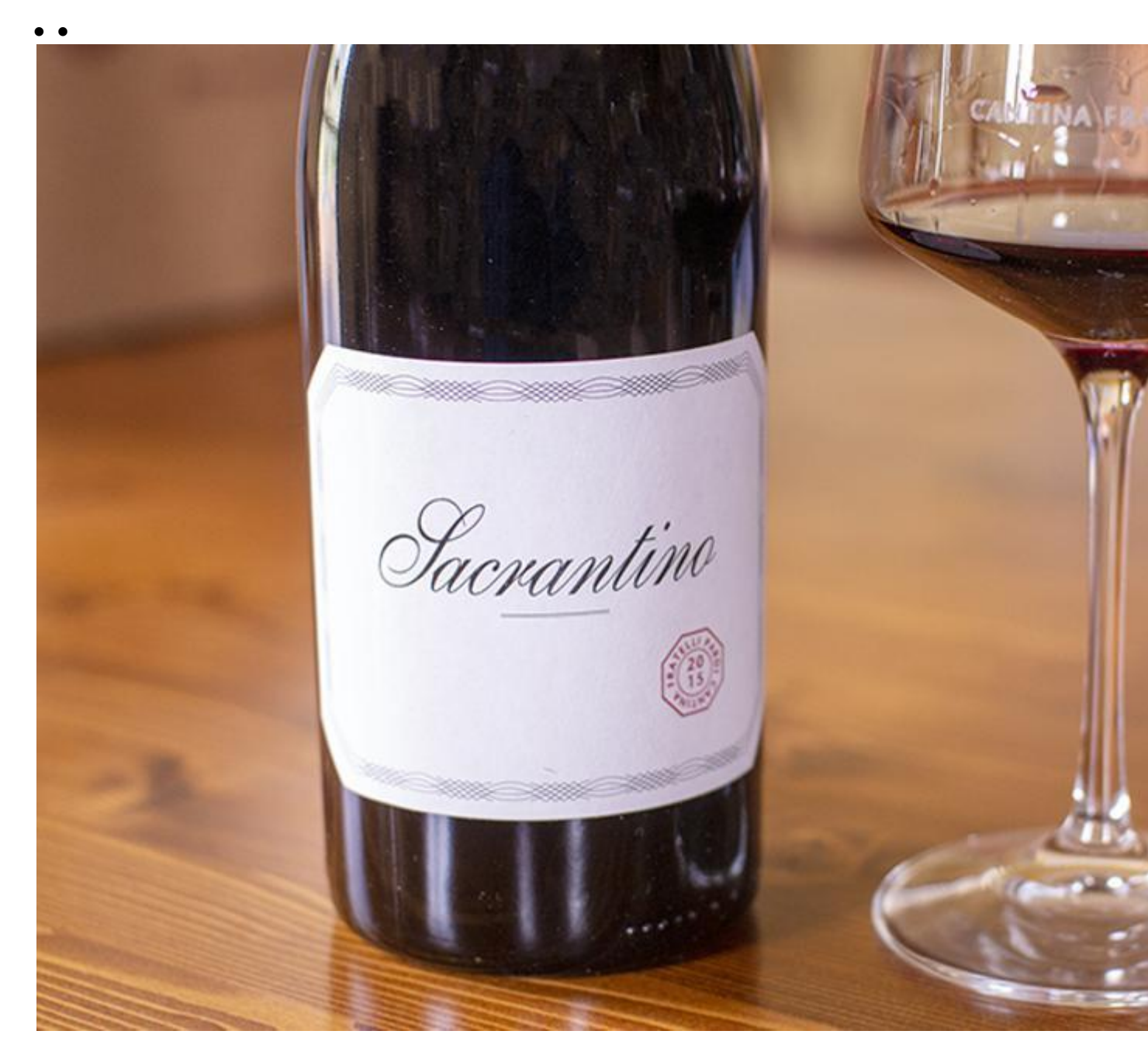
Cantina Fratelli Pardi Montefalco Sagrantino "Sacrantino"